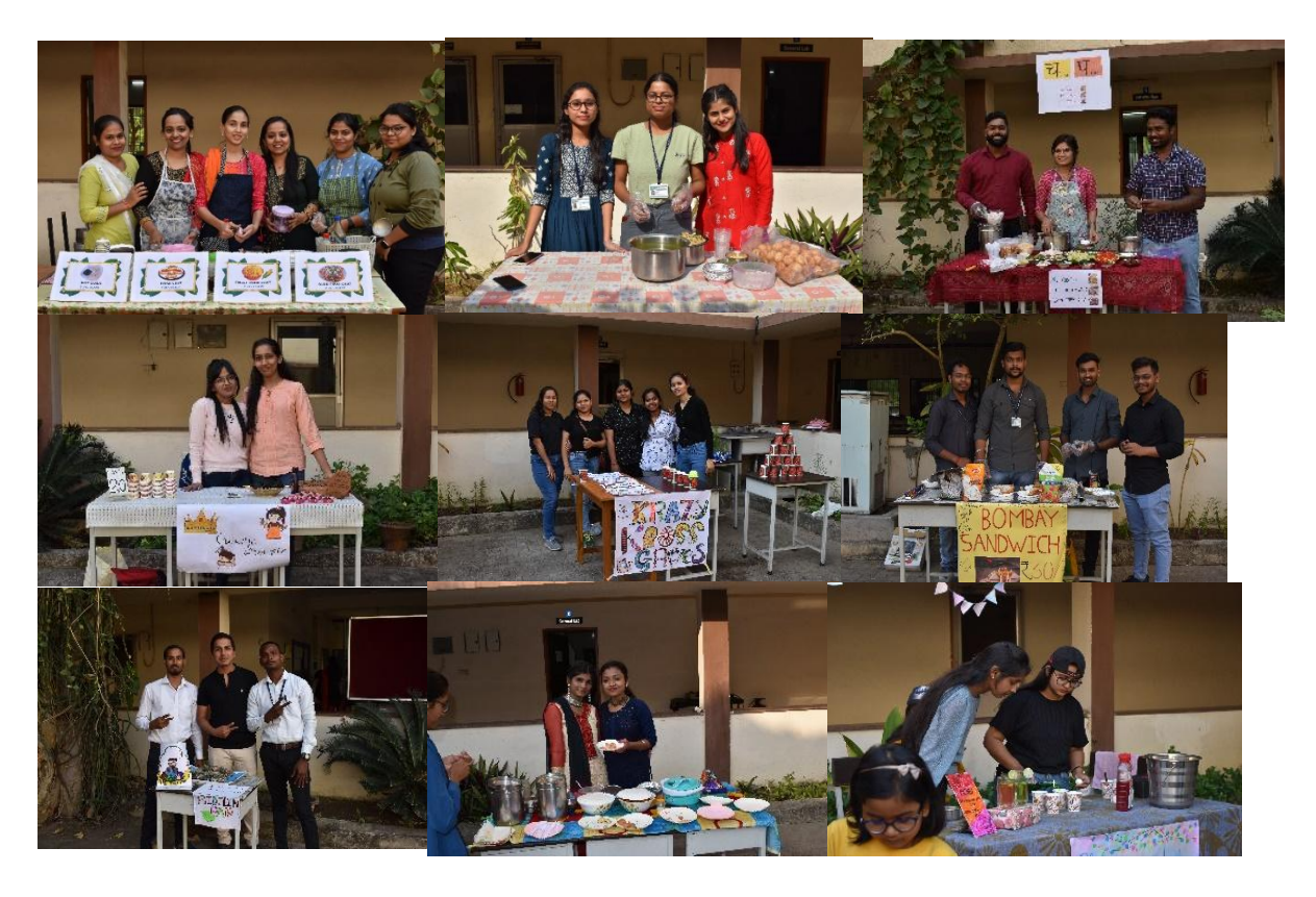
Various food stalls with their chefs