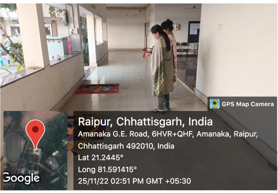
Judges evaluating the rangolis made by students