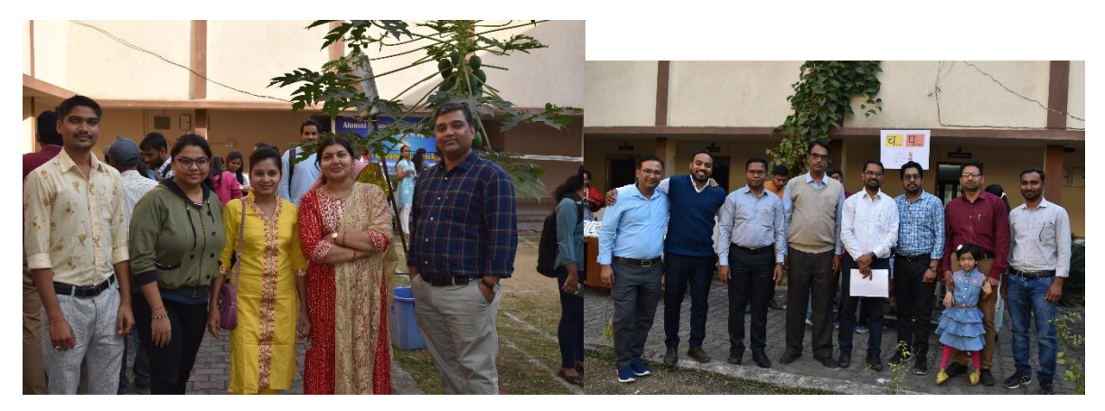
Interaction with previous alumni