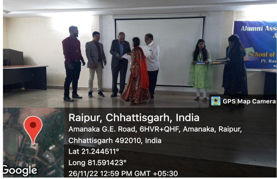
Achievers receiving their certificates and medals