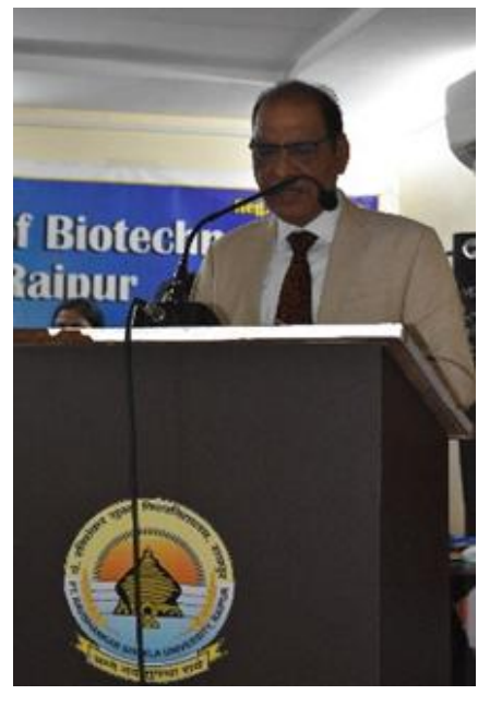
Speakers of the ceremony