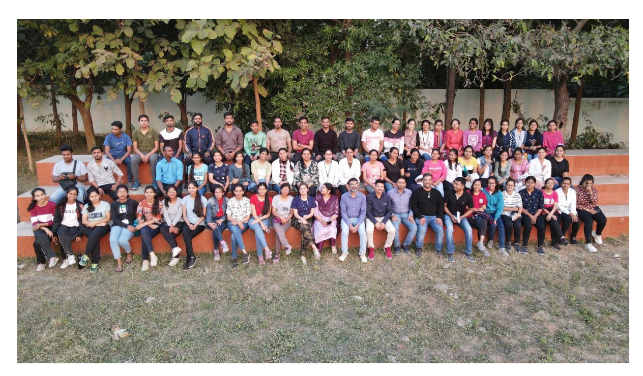
THE BIOTECH FAMILY 2022