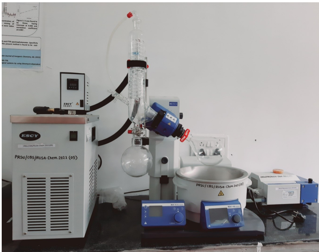
Fig 5. Rota Evaporator