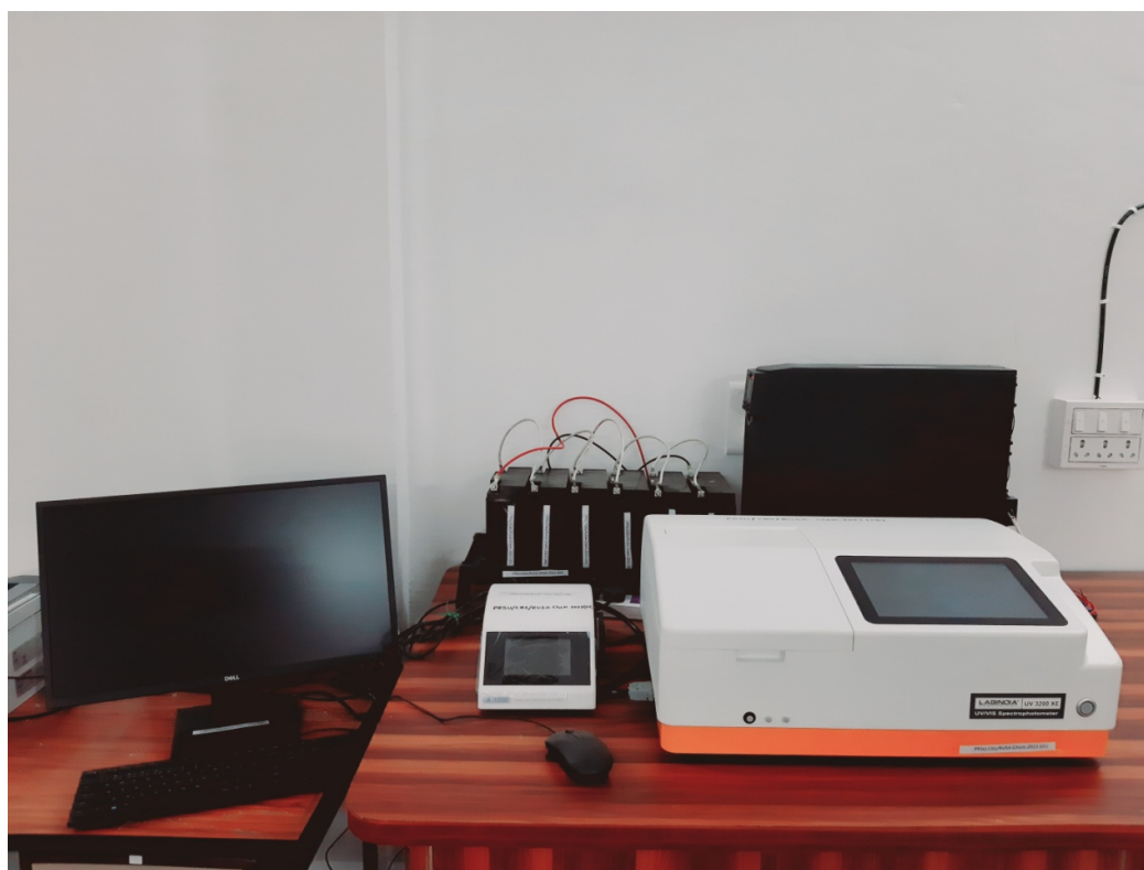
Fig 2. UV Spectrophotometer