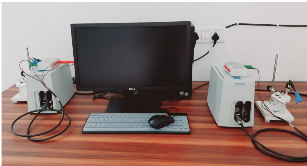
Fig 1. Potentiostat