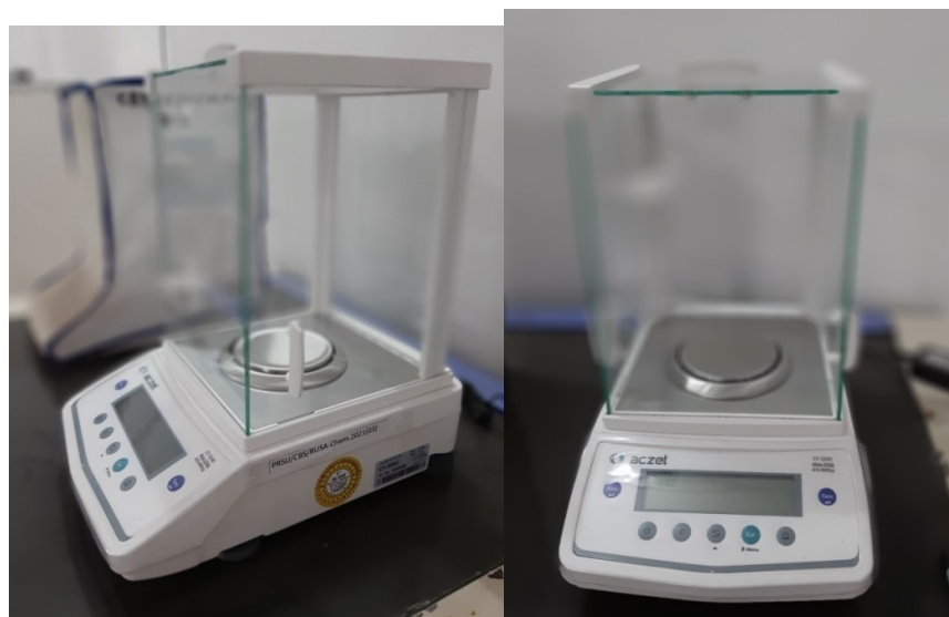
Fig 6. Electronic Balance