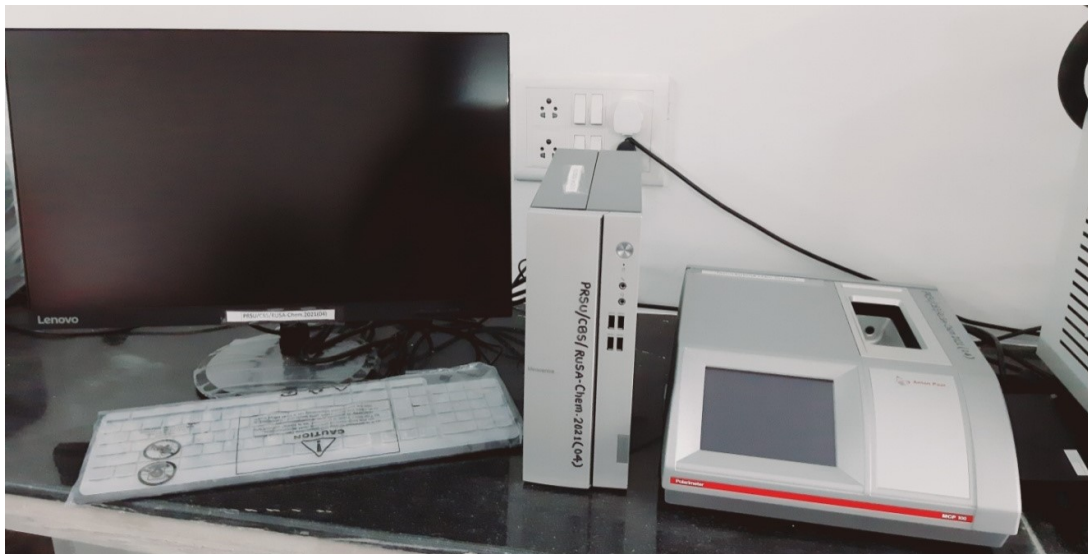
Fig 4. Polarimeter