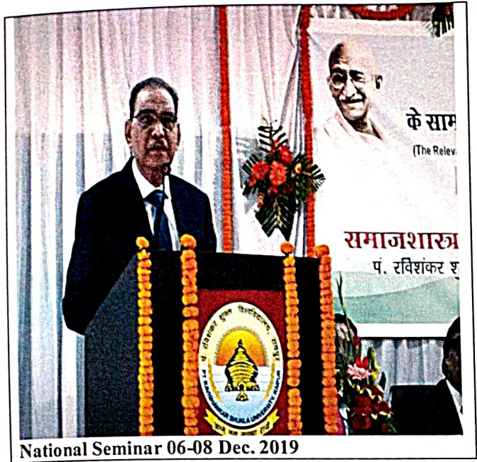
National Seminar 06-08 Dec. 2019