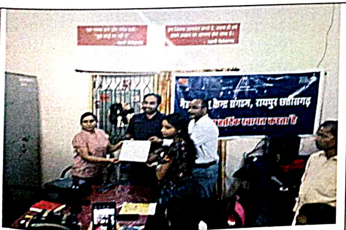
Agency Placement NYK; Raipur