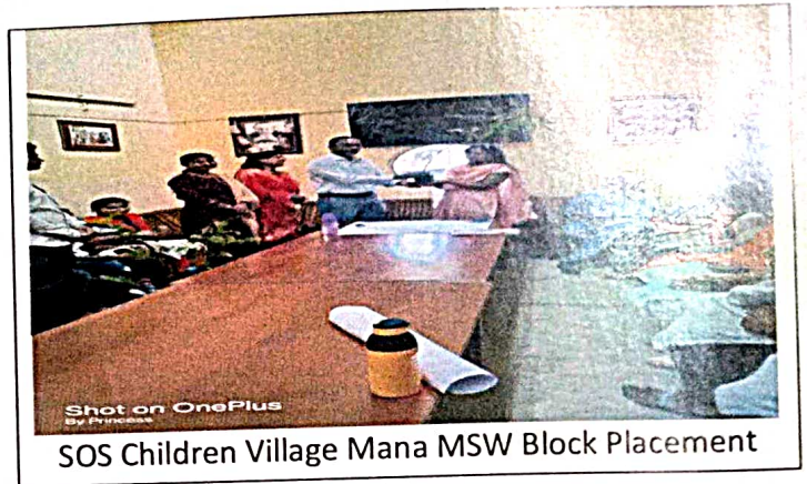
SOS Children Village Mana MSW Block Placement