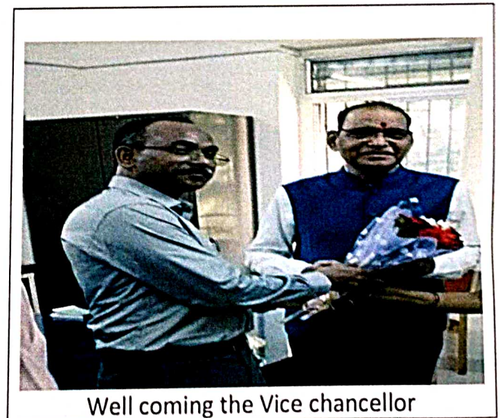
Well coming the Vice chancellor