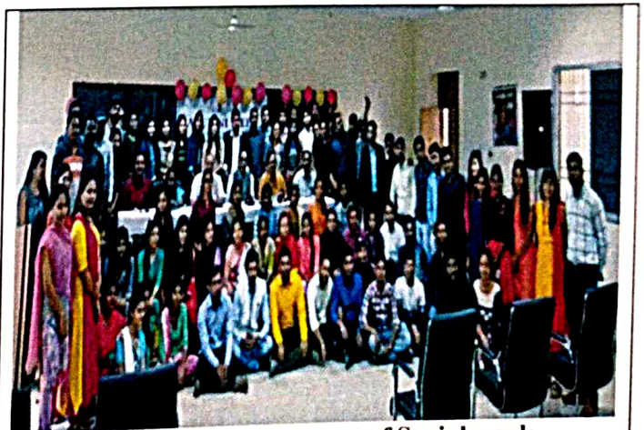
Alumni Meet Program of Social work