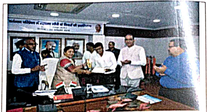
Honored by Honorable Governor of Chhattisgarh State on the occasion of Gandhi Jayati