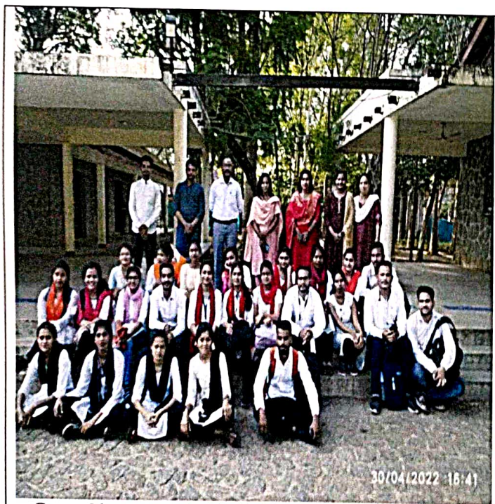
Group Photo of MSW 2021-22 SOS Child Village Mana Camp, Ocagen -Block Placement