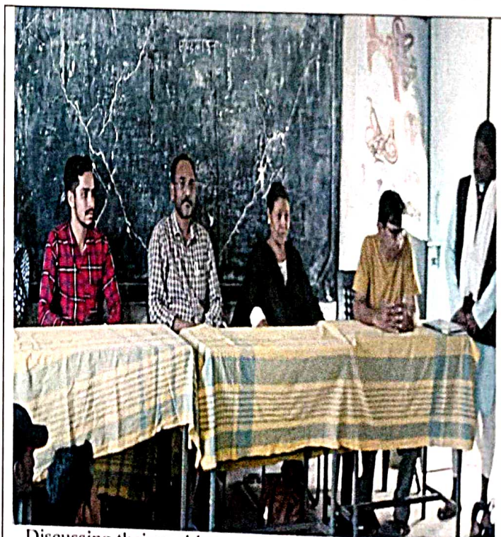
Discussing their problems with the Baiga tribe of Polmee village.