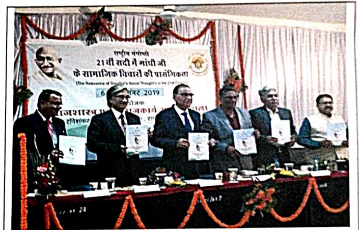
National Seminar 06-08 Dec. 2019 And Alumni Meet 2019