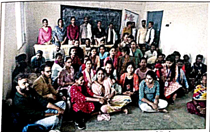
Group Photograph of Middle School of Polmee