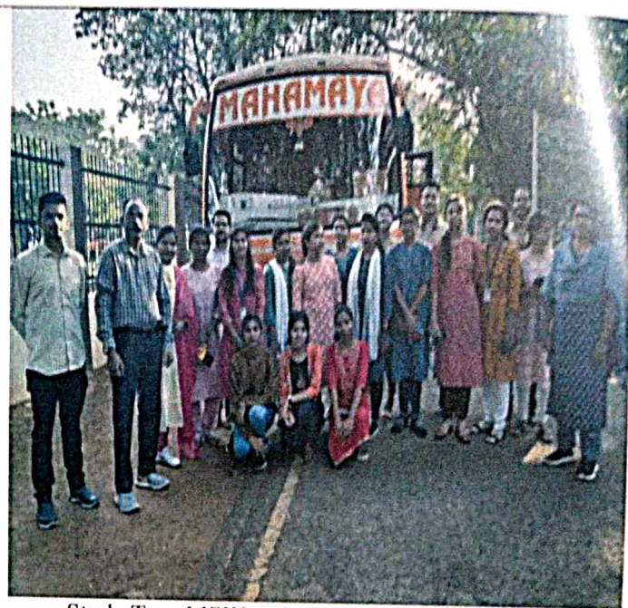
Study Tour MSW and MA Sociology May 2022, Department to Polmee (Pandariya) District- Kawardha.