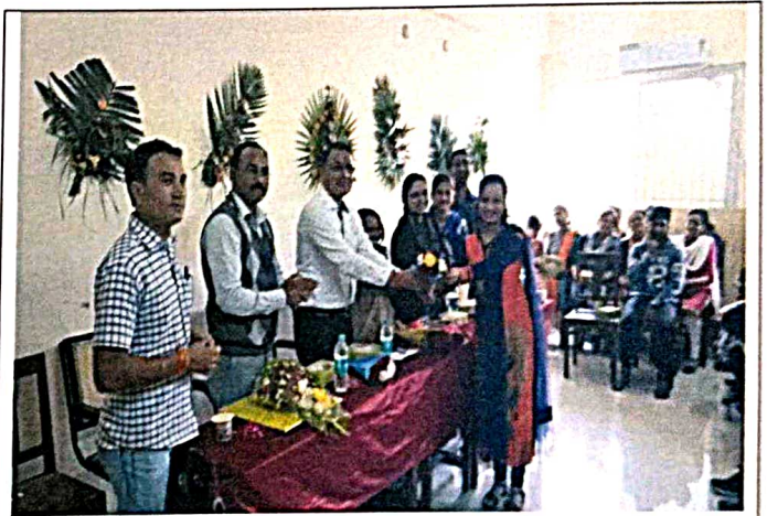
Well-come Program for New HOD