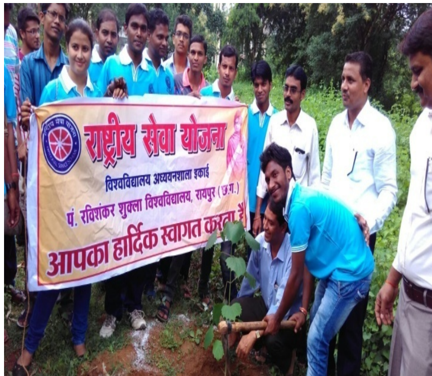
05 September 2016