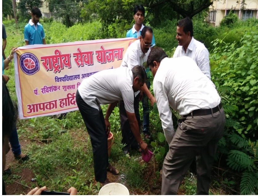
05 September 2016, Plantation by Prof.N.K.Baghmar