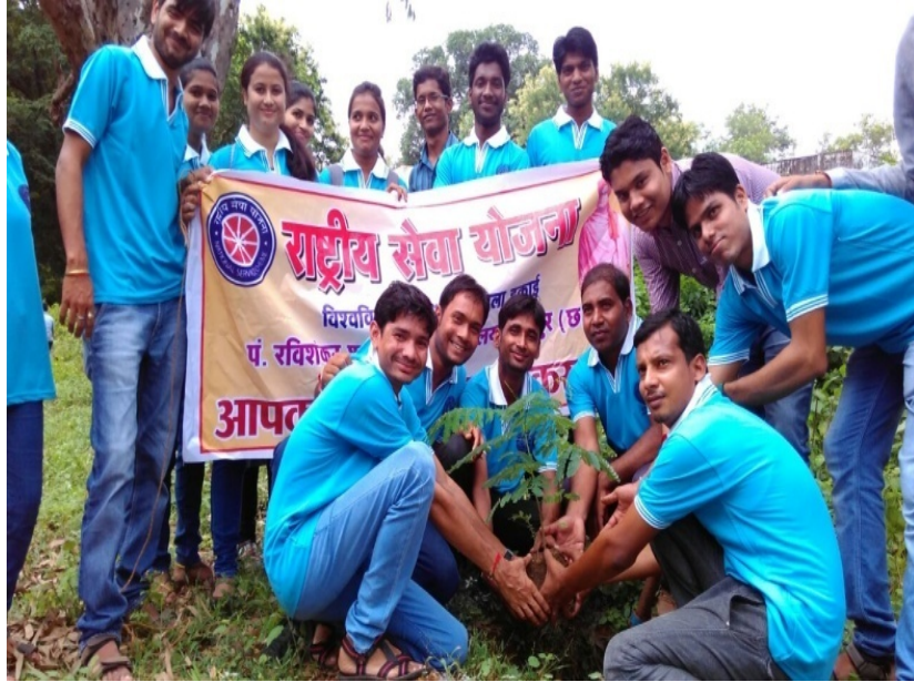
05 September 2016