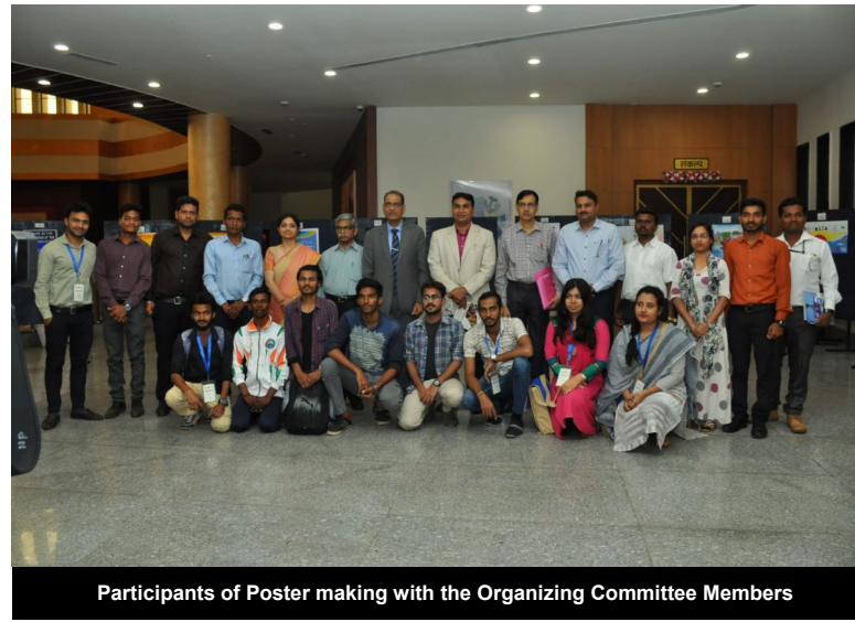
Participants of Poster making with the Organizing Committee Members