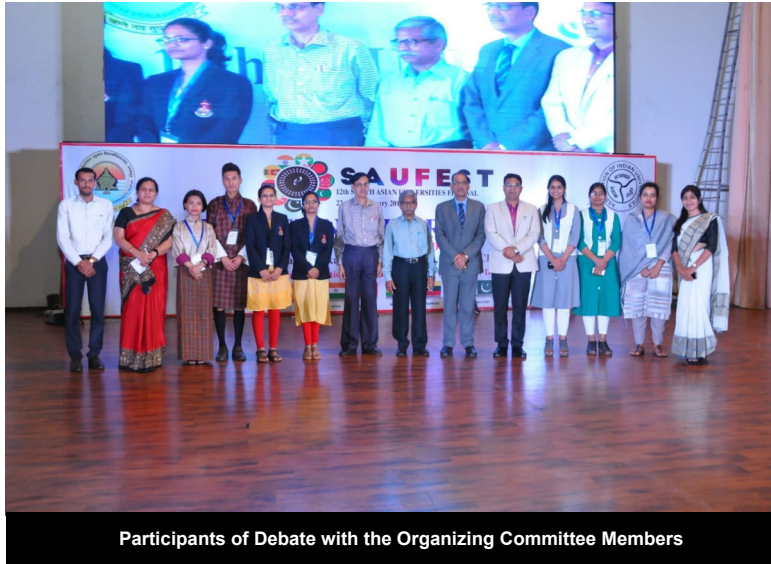
Participants of Debate with the Organizing Committee Members